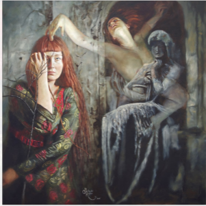
Memento mori, Oil on canvas, 120 x 120 cm, 2015