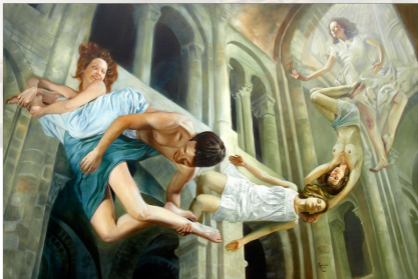
Veni creator spiritus | Oil on canvas | 120 x 180 cm | 2011