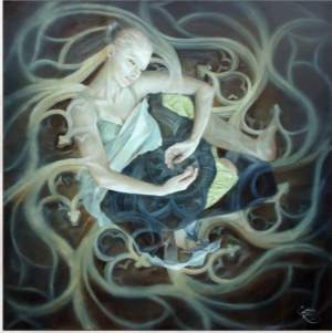
"I was a child who dreamed a lot", Oil on canvas, 120 x 120 cm, 2015