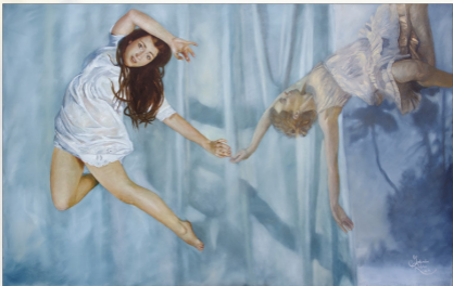
"And yet there's One, holding this fall with endless gentleness in both his hands" Oil on canvas | 100 x 160 cm | 2015