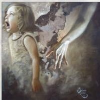
Scream | Oil on canvas | 60 x 60 cm | 2014