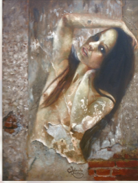
Perception 3 | Oil on canvas | 60 x 80 cm | 2014