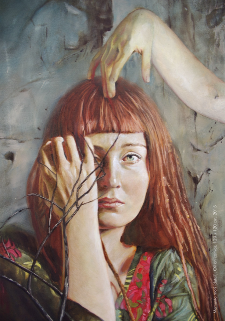
Memento mori (detali), Oil on canvas, 120 x 120 cm, 2015