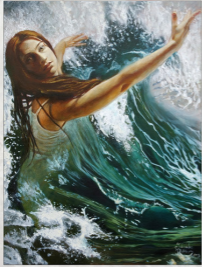
"The next tide will erase the way" | Oil on canvas | 60 x 80 cm | 2014