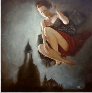
"Dreams, which well up in your depths", Oil on canvas, 120 x 120 cm, 2015