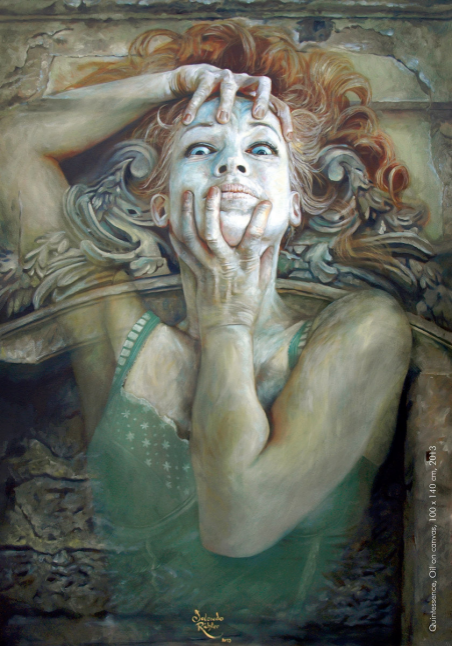
Quintessence, Oil on canvas, 100 x 140 cm, 2013