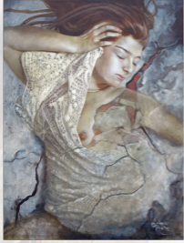
Perception 4 | Oil on canvas | 60 x 80 cm | 2015