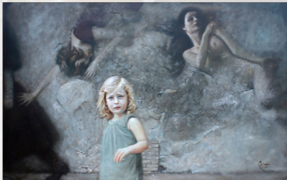
Revelation 1 | Oil on canvas | 100 x 160 cm | 2014