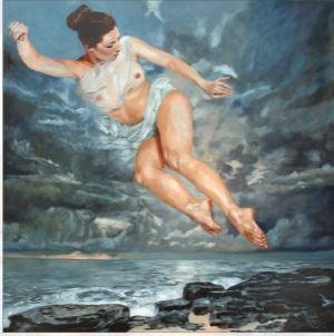
"You don't have to understand Life's nature", Oil on canvas, 120 x 120 cm, 2015