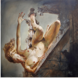
"I am at home between dream and day", Oil on canvas, 120 x 120 cm, 2015