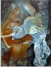
"And on the void we lie like balm to veil your gashed, broken places" | Oil on canvas | 60 x 80 cm | 2014