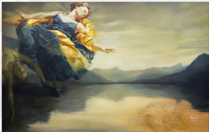
"Beyond the plains of eternity" | Oil on canvas | 100 x 160 cm | 2015