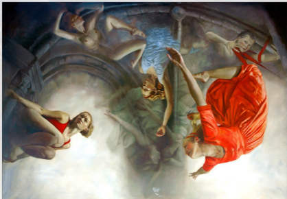
Transformation | Oil on canvas | 190 x 280 cm | 2012