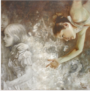
Vision, Oil on canvas, 100 x 100 cm, 2014